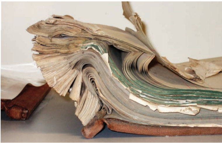
University of Melbourne Conservatorium of Music, Orchestral ledger, 1910–1954, unpublished manuscript, Louise Hanson-Dyer Music Library, Rare Collections.

The ledger before treatment was in a parlous state.