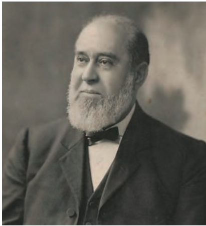
H.C. Russell, the Government Astronomer at Sydney Observatory from 1870 to 1905, photographed January 1898 by J. Hubert Newman, photographic (possibly platinum) print on paper. Powerhouse Museum Collection, Sydney, 95/239/24.