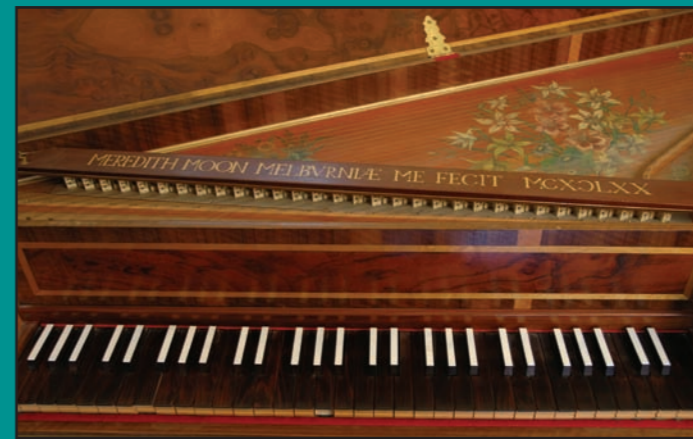
Spinet (detail) made by Meredith Moon in 1970.