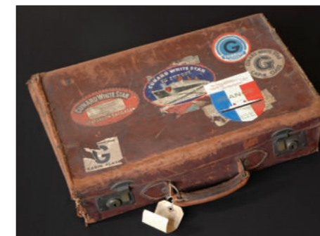
A well-travelled leather suitcase belonging to Percy Grainger. This case was ultimately used to transport Grainger's music manuscripts to the Museum.