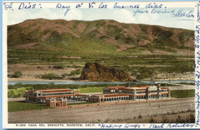
Postcard sent by Rose to Percy from the Casa del Desierto in Barstow, California.

The Graingers stayed at the Casa Del Desierto, one of a chain of hotels along the Santa Fe railroad known for their distinctive architecture and prim 'Harvey Girl' waitresses. They were the brainchild of Fred Harvey, an entrepreneur who used savvy marketing to advertise isolated outposts as perfect destinations for even unadventurous travellers. Harvey built a hotel every 200 miles along the railroad. When you stepped off the train and into a Harvey Hotel you could expect linen tablecloths, fine china, crystal glasses and gourmet food. The Casa Del Desierto had a turquoise-tiled ballroom and wide, oak-trimmed staircases.