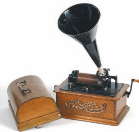
Edison Phonograph, used by Percy Grainger to record folk songs on wax cylinders, n.d. (after 1903).

The Museum layout will include six discrete exhibition galleries, one of which will be a temporary exhibitions gallery. The other five galleries will house permanent exhibitions (with rotating material) — each highlighting a different aspect of the Museum's collection. Additionally, space is to be allocated as a multipurpose venue for seminars, intimate performances, meetings and all related purposes focussing on Percy Grainger's life and works. Lovell Chen, the heritage architects heading up the restoration project, have consulted with Museum staff and stakeholders to refine the particulars of space allocation. Likewise, Professor Warren Bebbington has consulted further with the University's Cultural Collections Committee to ensure an open