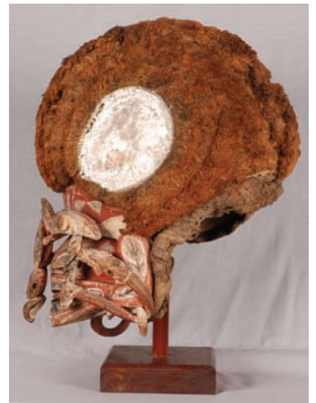
Tatanua mask after conservation treatment.

Students in the Master of Cultural Materials Conservation course, taught through the Centre for Cultural Materials Conservation, benefit from the opportunity to study and conserve significant items from the University's cultural collections. Students are able to investigate the history, materials used, fabrication techniques and deterioration processes of a wide range of object types. Following these investigations, the students develop and apply conservation treatments specifically chosen to improve the chemical and physical stability of the object, while respecting the object's cultural and historical values. Working with the Grainger Museum collection has benefits that flow both ways. Students have an authentic learning experience, and the research and conservation treatments they undertake help to increase our own understanding of the collection and to preserve the items in good condition into the future. The following is an account by Sarah Babister, a second year student, who spent many hours conserving a malagan headpiece, originating from New Ireland, Papua New Guinea.