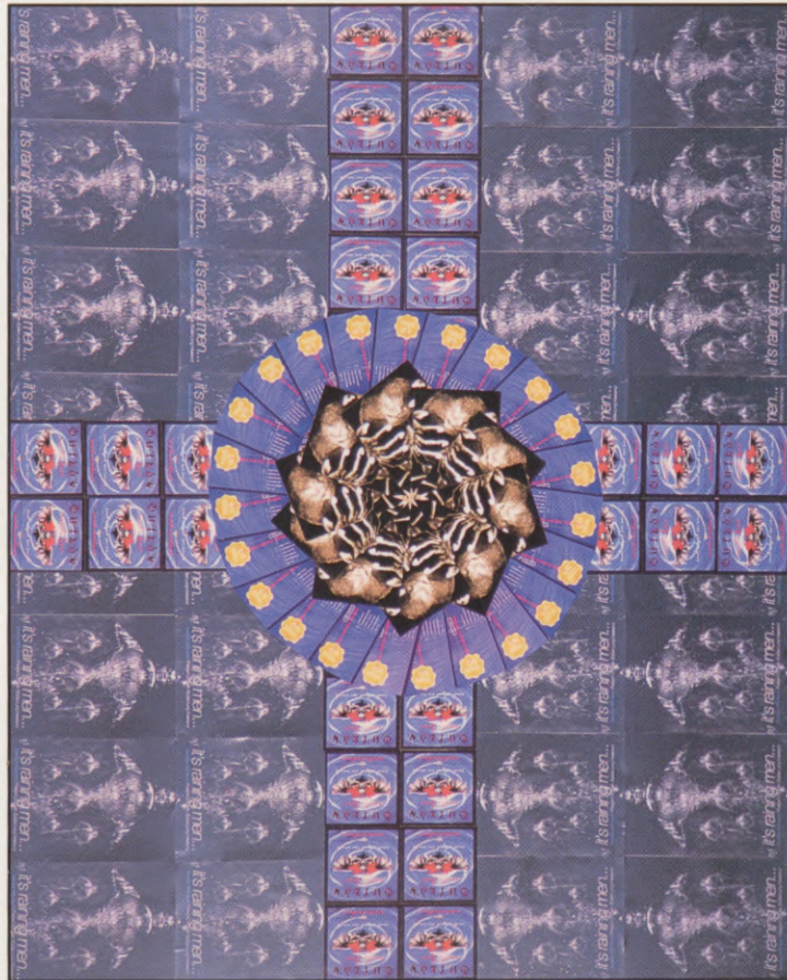
Richard Evans "Harmony" (from the series "Sabotage: Collages Composed from Nightclub Passes", 1995). See article Art in the Library , page 36.