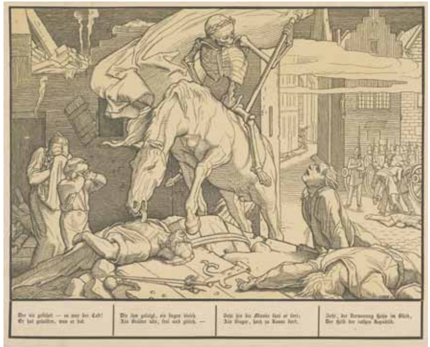
Below: Alfred Rethel, Plate 6 from Ein Todtentanz aus dem Jahre 1848 , woodcut, block: 25.1 x 31.6 cm. Reg. no. 2010.0004.006, purchased 2010, Baillieu Library Print Collection, University of Melbourne.

The Rethel death dance set completes the Baillieu Library's holdings of this artist's most renowned prints. The other pair of Rethel prints was purchased in 1984 and contains what I consider one of the most arresting prints in the Library's collection for its chilling and bizarre qualities. Der Tod als Erwürger (Death the strangler) of 1851 (see page 36) depicts a masquerade party. The dance floor is littered with dead partygoers