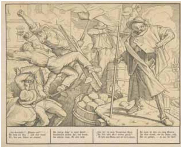
Left: Alfred Rethel, Plate 5 from Ein Todtentanz aus dem Jahre 1848 , woodcut, block: 25.1 x 31.6 cm. Reg. no. 2010.0004.005, purchased 2010, Baillieu Library Print Collection, University of Melbourne.

Through his acts of illusion, Death has now achieved his goal. In plate 5 (above), the police are firing a cannon into the mob, and the blast has shattered a beam on the makeshift barricade constructed from barrels, bricks and wood. As the rebels fall, other insurgents rush to take their place and face their doom. 15 Nonchalantly, Death stands with a bloodied flag on the mattress on top of the barricade, and reveals his frightening body to his chosen. The poem this time begins with Death's speech: 'Now I am keeping my promise to you; You all want to be equal to me', and concludes with 'The blood flows freely like the red flag; He who led them was Death.' 16 Plate 5 bears perhaps the strongest resemblance to a graphic novel, with its dynamic and exaggerated action. The comic-strip quality of the series may explain its accessibility and popularity in 1849.