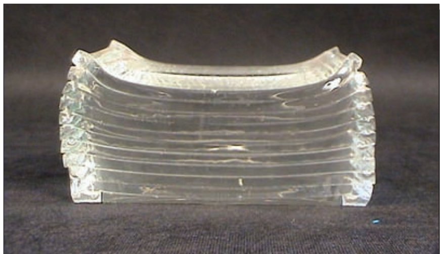
A slab of optical glass, an early attempt at producing optical glass as part of Australia's Optical Munitions Program. It was made in the Chemistry Department, University of Melbourne, c. 1941–1942, and comprises eleven glass plates, 7.0 x 13.5 x 9.5 cm, 'welded' together. (Physics Museum Collection, School of Physics, University of Melbourne, reg. no. 70)