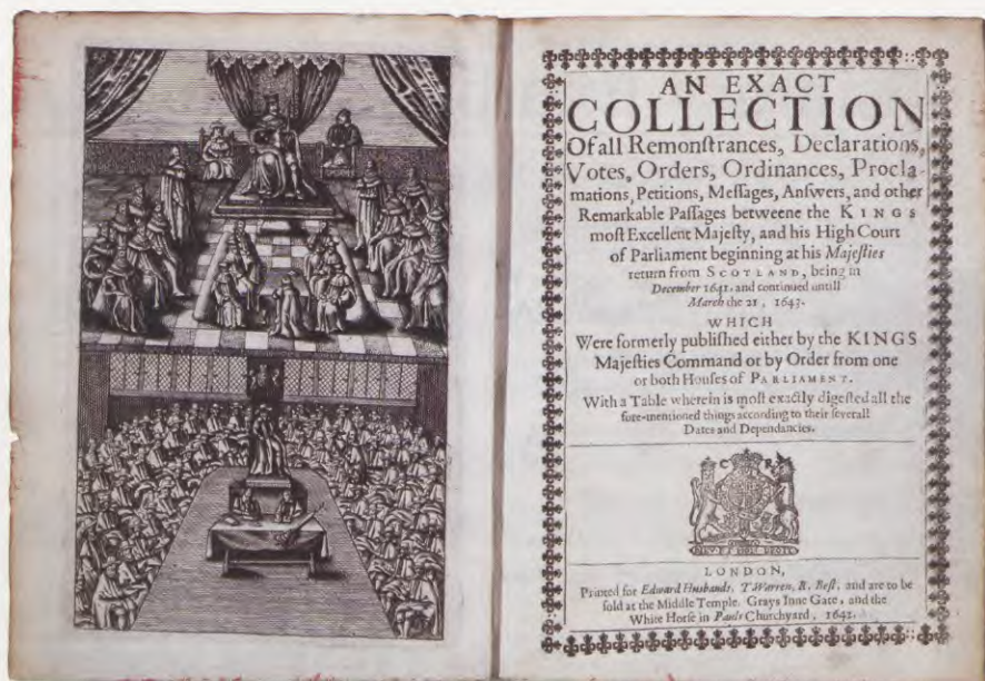
Title page of An exact collection of all remonstrances, declarations, votes, orders, ordinances, proclamations, petitions, messages, answers, and other remarkable passages between the Kings most excellent Majesty, and his High Court of Parliament, London, 1643.