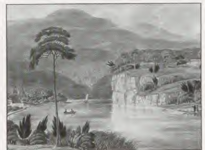
Grimwade Collection: "View of the Governor's Retreat, New Norfolk, Van Diemen's Land", in Joseph Lycett, Views in Australia, or, New South Wales and Van Diemen's Land delineated: in fifty views with descriptive letter press , London, 1824.

This collection of about 1,000 volumes belonging to Sir Russell and Lady Grimwade was bequeathed to the University in 1973 as part of the larger bequest of the Miegunyah estate. Books were moved to the Library from 1979 onwards, but this transfer was not completed until 1987. The collection consists mainly of works of history, voyages, exploration, anthropology, natural history relating to Australia, including significant late 18th to early 19th century editions of fine early plate books.