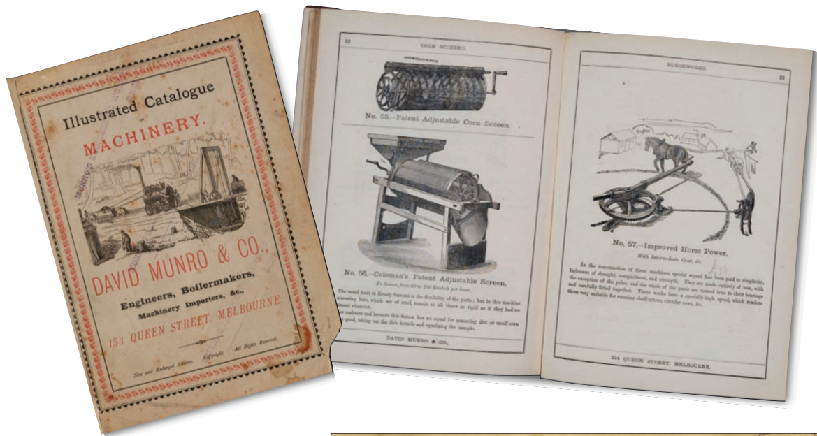
Above: Cover and illustrations of Revised Catalogue of Engines, Boilers, Agricultural, Mining, Sawing, and Other Machinery . (Melbourne, David Munro and Co, c. 1885.)