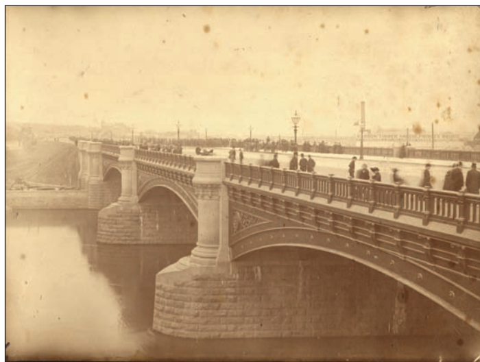
Right: Photograph of Princes Bridge, Melbourne, which was found in the copy of David Munro and Co.'s catalogue shown above.

University of Melbourne Archives. Also acquired was a rare pamphlet, The Present State of Melbourne and the Gold Fields of Victoria , published in London in 1853 as a guide for intending 'diggers': only two other copies of this work are known to be held in Australian libraries.