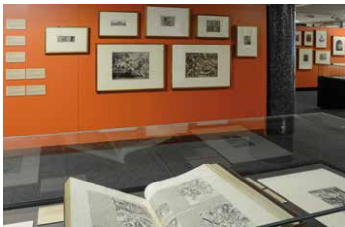
Left: Part of the Noel Shaw Gallery in the Baillieu Library.