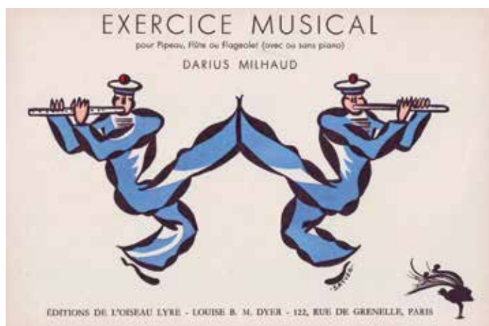
Cover, with illustration by Sam Atyeo, for Darius Milhaud, Exercice musical pour pipeau, flûte ou flageolet (avec ou sans piano) , Paris: Éditions de l'Oiseau-Lyre, 1934. Éditions de l'Oiseau-Lyre Archive, Louise Hanson-Dyer Music Library, University of Melbourne.

Linnaeus. Underwritten by the Royal Society and listed as no. 87 in the Grolier Club's One hundred books famous in science , the three volumes of Ray's text describe and classify over 18,000 species of plants, based on empirical observation. Ray's discovery that seed-plants fall into two divisions (two seed-leaves or only one) became a basic feature for classifying flowering plants.