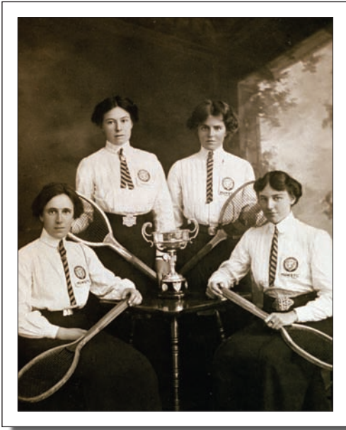
The women's tennis team, University of Melbourne, photographer and date unknown, probably between 1910 and 1915, 13.5 x 8 cm.

commenced the great rivalry between the Universities of Melbourne and Sydney. Four years later, the first intervarsity women's tennis match was held and the Sydney team won the tournament. The details of these matches along with photographs were documented at the time, for future generations to read, and can be found in the Archives. Details of the long-lived University rivalry should warm the hearts of current Team Melbourne supporters and participants, particularly as our University was once again victorious over the University of Sydney at the Australian University Games this year. Thus, 98 years after the first tennis victory over the University of Sydney, the current University of Melbourne women's tennis team won the gold medal again. Hopefully records of the continued rivalry between the Universities of Melbourne and Sydney will be available for future generations to celebrate, and take pride in, their sporting history.