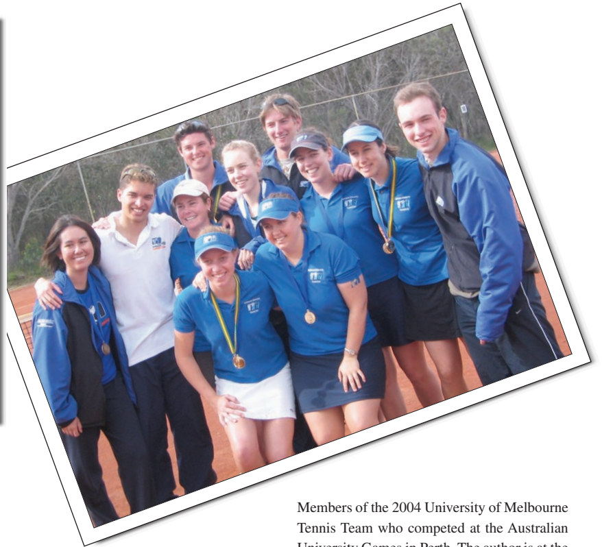
Members of the 2004 University of Melbourne Tennis Team who competed at the Australian University Games in Perth. The author is at the left of the photo.

commenced the great rivalry between the Universities of Melbourne and Sydney. Four years later, the first intervarsity women's tennis match was held and the Sydney team won the tournament. The details of these matches along with photographs were documented at the time, for future generations to read, and can be found in the Archives. Details of the long-lived University rivalry should warm the hearts of current Team Melbourne supporters and participants, particularly as our University was once again victorious over the University of Sydney at the Australian University Games this year. Thus, 98 years after the first tennis victory over the University of Sydney, the current University of Melbourne women's tennis team won the gold medal again. Hopefully records of the continued rivalry between the Universities of Melbourne and Sydney will be available for future generations to celebrate, and take pride in, their sporting history.